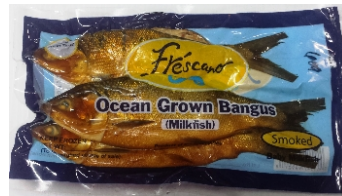
FRESCANO SMOKED MILKFISH Regular $8.99