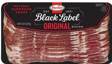
HORMEL BLACK LABEL BACON Regular $10.49