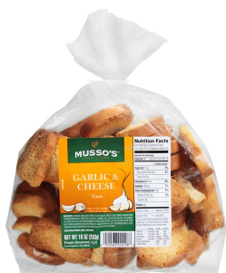
Bakery MUSO'S GARLIC & CHEESE TOAST $7.99