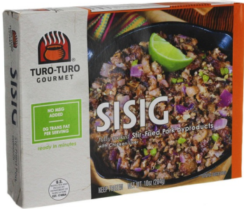
TURO TURU GOURMET SISIG Regular $6.79