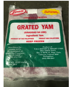
SIMEX GRATED YAM Regular $3.99