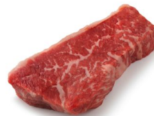
Meat ANGUS TRI TIP STEAK $11.69/LB