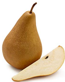
BOSC PEAR $3.29/LB