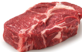
BONELESS CHUCK $5.79/LB