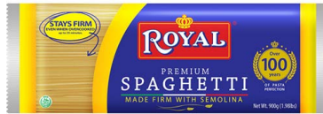
ROYAL SPAGHETTI Regular $2.49