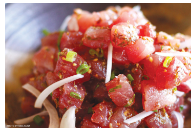
Deli MAUI ONION POKE $13.59/LB